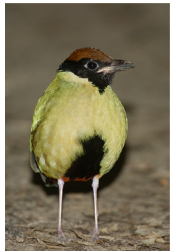
Noisy Pitta – Kingfisher Park, Julatten, Queensland The Noisy Pitta is a very colorful, ground dwelling bird that inhabits the rainforests of Queensland and northern New South Wales. These amazing birds are often very secretive and difficult to see, despite their gaudy coloring. There are two resident pairs at Kingfisher Park and one of the birds proved to be very cooperative the first morning I was there as it foraged in the leaf litter.