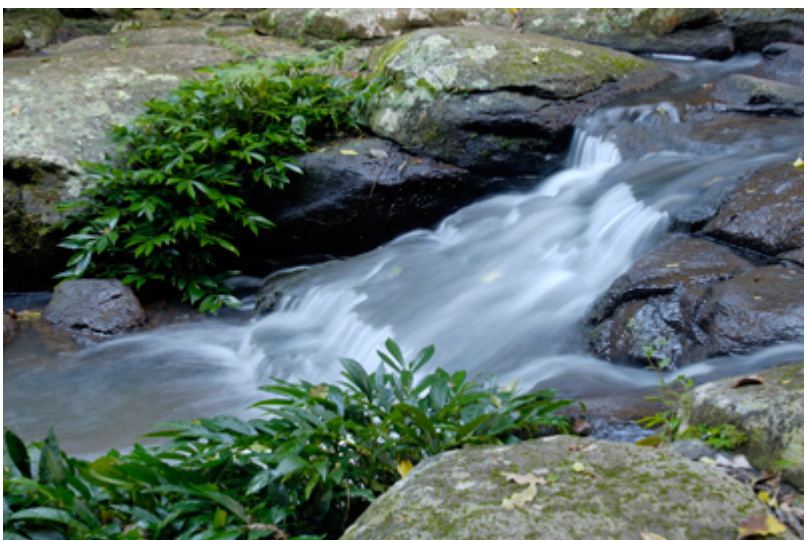
Rapid on Moran Creek – Lamington National Park, Queensland

I spent nearly a week in the subtropical rainforests of Lamington National Park, on the Queensland/New South Wales border. The park is famous for its rainforests and endemic birdlife, but the park is also full of waterfalls and small rapids. This particular rapid is just upstream of Moran Falls where Moran Creek drops several hundred meters down a sheer cliff.