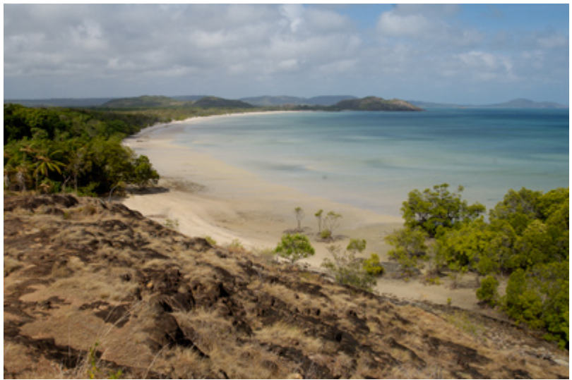
The Tip – Cape York Peninsula, Queensland

Again, why would someone drive over 1,000 kilometers from Cairns (the closest city) over rough roads just to stand on the northernmost point of the Australian continent? Well, The Tip just so happens to be a gorgeous place with rocky headlands, white sand beaches, and emerald green water (with crocs, sharks, and stingers so no swimming). This particular image was taken about 500 meters from the actual Tip (off to the right) and is looking back along the beach to where I am camped, and writing this, down at the other end. It has been quite an adventure, one that not many people get to experience, and I am sure glad that I decided to do it.