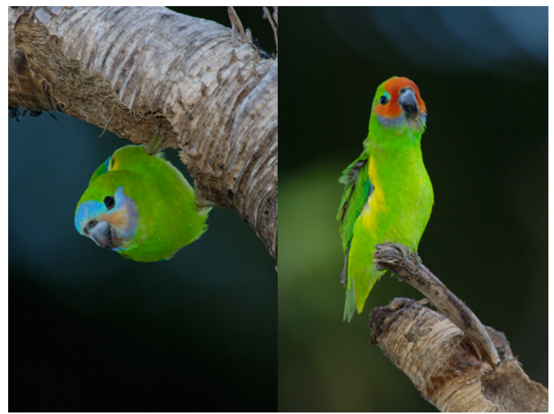
Double-eyed Fig-Parrot – Portland Roads, Cape York Peninsula, Queensland The Double-eyed Fig-Parrot is Australia's smallest parrot and is rather cute. There are three distinct races, this being the race found on the Cape York Peninsula. I was fortunate enough to be directed to a pair that was just beginning to excavate a nest cavity at Portland Roads, just outside Iron Ranges National Park. The male bird (on the right) sat by and watched while the female (left) did most of the work while I was there.