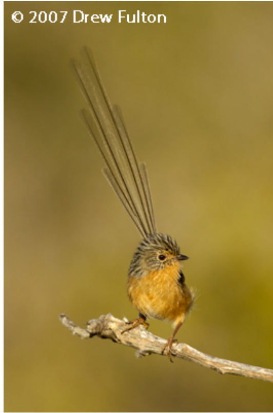
Southern Emuwren – Cheyne Beach, Waychincup National Park, Western Australia

While I was thrilled with a number of the images I took on that day, this just might be my favorite. This image clearly shows the distinctive tail of the emuwren, is in perfect evening light, and the background is even complimentary. I can't ask for much more than that!