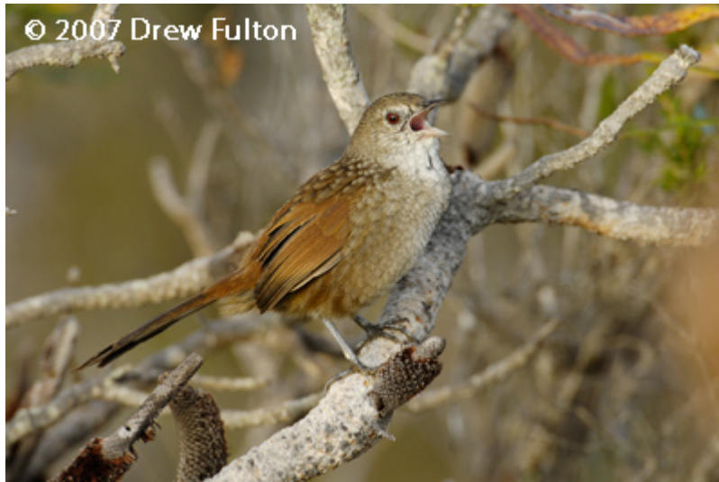
Western Bristlebird – Cheyne Beach, Waychinicup National Park, Western Australia

The second of the “skulkers” and quite the opposite of the above image. This time I was after a rather rare bird and I can barely describe my euphoria at capturing this bird in the relative open. I never thought an image like this would be possible and then the opportunity presented itself and I came away with this.