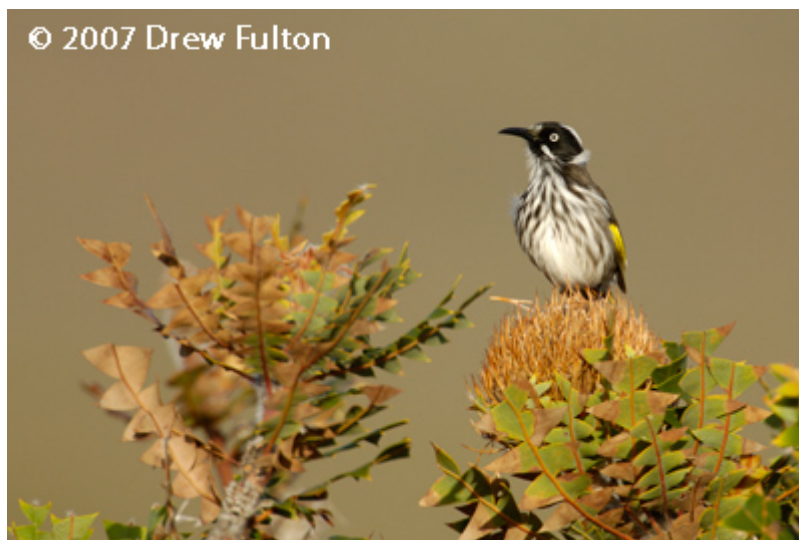
New Holland Honeyeater – Cheyne Beach, Waychinicup National Park, Western Australia

During my time at Eyre Bird Observatory, my goal was to photograph this beautiful pigeon. Bronzewings are typically very shy birds and I have found the Brush to be even shy than the Commons. In any case, I had only seen the Brush on one other occasion and didn't have a chance to photograph him. Therefore, when I heard they were relatively acclimated to people and regular visitors to the bird baths at Eyre Bird Observatory, I jumped at the chance. This was one of my favorite images from my time there.