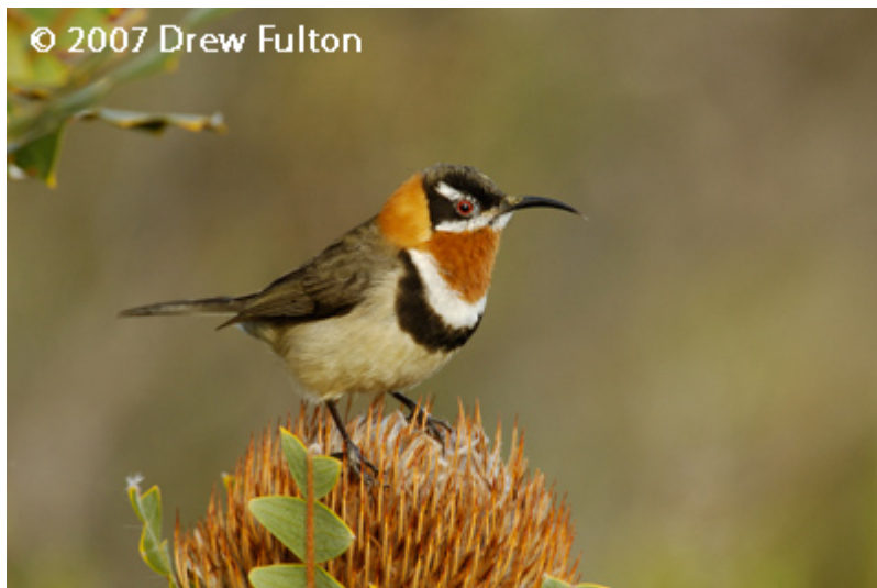
Western Spinebill – Cheyne Beach, Waychinicup National Park, Western Australia

The second of the “skulkers” and quite the opposite of the above image. This time I was after a rather rare bird and I can barely describe my euphoria at capturing this bird in the relative open. I never thought an image like this would be possible and then the opportunity presented itself and I came away with this.