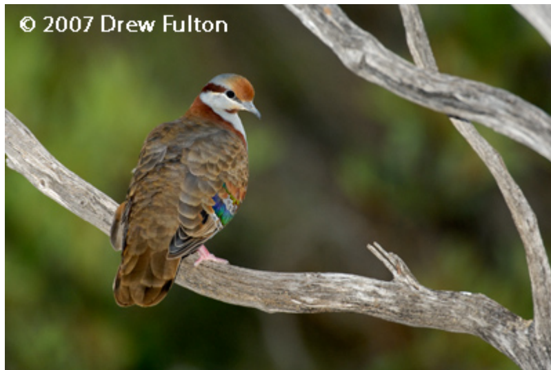
Brush Bronzewing – Eyre Bird Observatory, Nuytsland Nature Reserve, Western Australia

During my time at Eyre Bird Observatory, my goal was to photograph this beautiful pigeon. Bronzewings are typically very shy birds and I have found the Brush to be even shy than the Commons. In any case, I had only seen the Brush on one other occasion and didn't have a chance to photograph him. Therefore, when I heard they were relatively acclimated to people and regular visitors to the bird baths at Eyre Bird Observatory, I jumped at the chance. This was one of my favorite images from my time there.