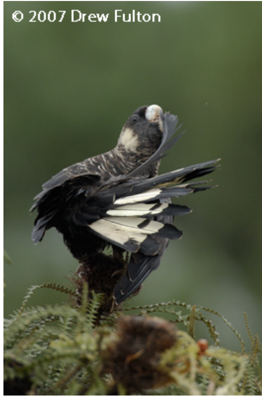
Short-billed Black-Cockatoo – Baladonia Track, Western Australia

I came across a flock of these birds feeding in some banksias as I was making my way south towards Cape Le Grande National Park. It was raining softly but I still managed to fire off a few frames of these birds before the rain increased past the point where photography was possible. This preening shot was one of my favorites.