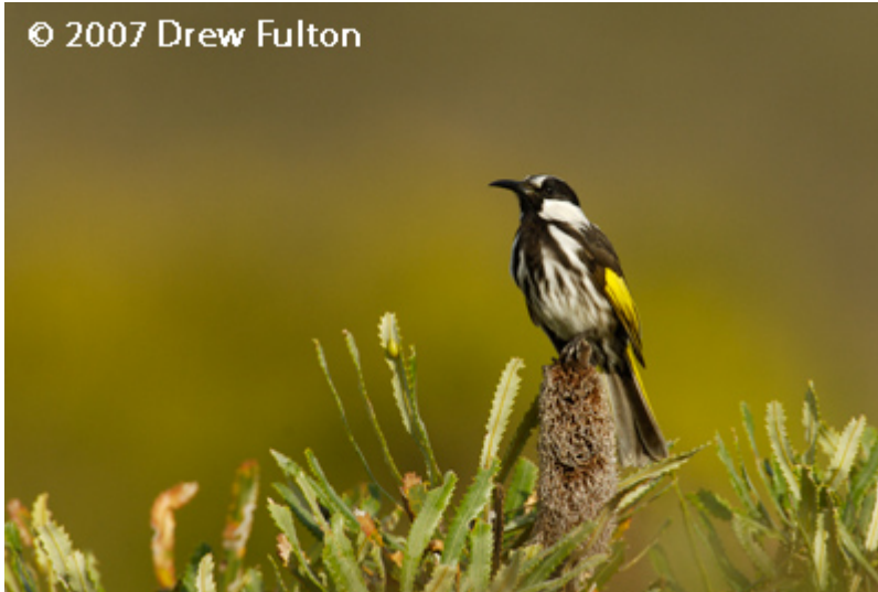
White-cheeked Honeyeater – Cheyne Beach, Waychinicup National Park, Western Australia

I had photographed a White-cheeked Honeyeater in Far North Queensland but I wasn't totally pleased with the image. When I saw the numerous birds feeding in the heath at Waychinicup, I was quite pleased and even happier when I got photos of this bird. I couldn't get real close, but I rather like the way the bird and the banksia make up the image.