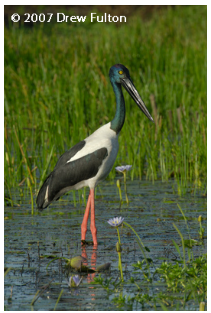
Jabiru – Fogg Dam, Northern Territory

The Jabiru is one of the most beautiful storks I have ever seen. I had a professor that once liken the stork family to "grumpy old men" and it describes North America's Wood Stork quite well but the Jabiru or Black-necked Stork is quite a beautiful bird. I love the green iridescence of the head and the bright red legs.