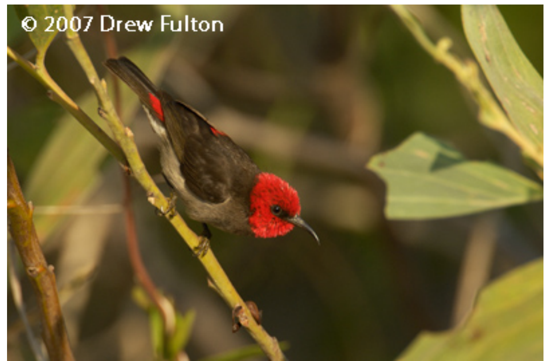
Red-headed Honeyeater – Palmerston Sewage Works, Palmerston, Northen Territory The Red-headed Honeyeater is another bird of the mangroves and they were fairly common behind the sewage plant in Palmerston. Again, I had seen this bird before but didn't have and photographs so I was quite pleased when this one came out on the edge of the forest for a few moments in nice morning light.