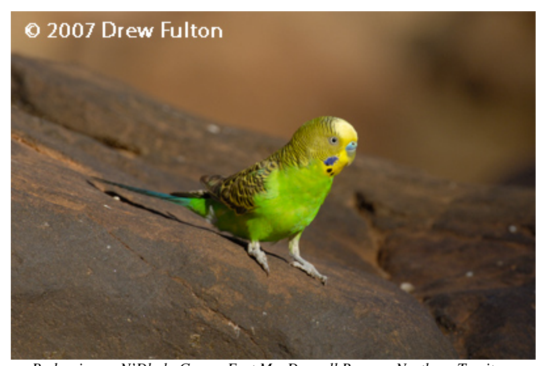
Budgerigar – N'Dhala Gorge, East MacDonnell Ranges, Northern Territory Imagine over 1,000 of these birds descending simultaneously on a water hole just a few meters

across. It was one of the most extravagant and beautiful events I have ever witnessed and it was nearly impossible to capture on film. A wide angle lens or a video camera might have captured a small aspect of it but I don't believe it would ever do it justice. It was one of those experiences that I will never forget.