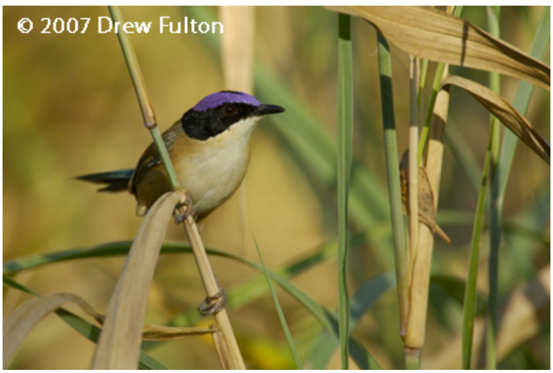
Purple-crowned Fairywren – Victoria River, Gregory National Park, Northern Territory There aren't many birds with that shade of purple anywhere in their plumage but these birds sure have a brilliant purple crown.