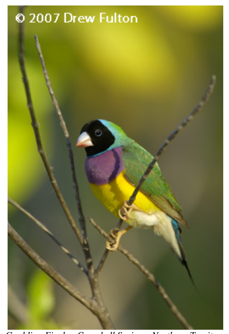
Gouldian Finch – Campbell Springs, Northern Territory

It isn't hard to imagine why there is such a high demand for these birds as pets that illegal capture has helped to drive this bird onto the Endangered Species List. The Gouldians are recovering quite nicely I hear and I saw them in several different sites but this was the only time I could really get some good photos of a bright male. The birds have several color morphs other than this one including red-faced and golden-faced birds. I did see a handful of red-faced birds but never saw the golden-faced bird.