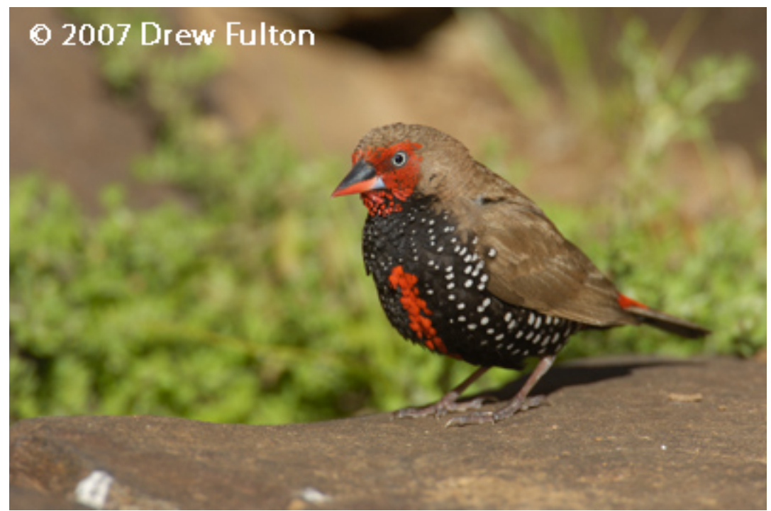
Painted Finch – N'Dhala Gorge Nature Park, East MacDonnell Ranges, Northern Territory These small yet beautiful birds were quite common in the East MacDonnell Ranges while I was there. I was able to photograph a pair that was coming in to drink at a waterhole in N'Dhala Gorge with hundreds of Zebra Finches and Budgerigars. I am not sure what it is about them, but I think they are one of my favorite Australian finches.