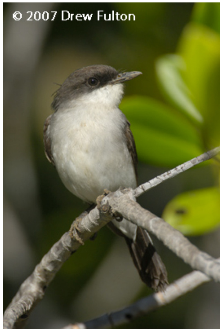
Mangrove Robin - Tiger Brennan Drive, Darwin, Northern Territory

Darwin is well known for its variety of tropical birds that live in the mangroves along the coast. For birders, these are often difficult birds to see as mangroves are not an easily accessed habitat with their complex root systems and deep mud making walking difficult, not to mention the biting insects that thrive there. Despite this, Darwin does have a few rather easily accessible spots and I found this particular bird just outside of downtown Darwin. I had seen a Mangrove Robin once before in Queensland but hadn't gotten any photos so was quite pleased with this shot.